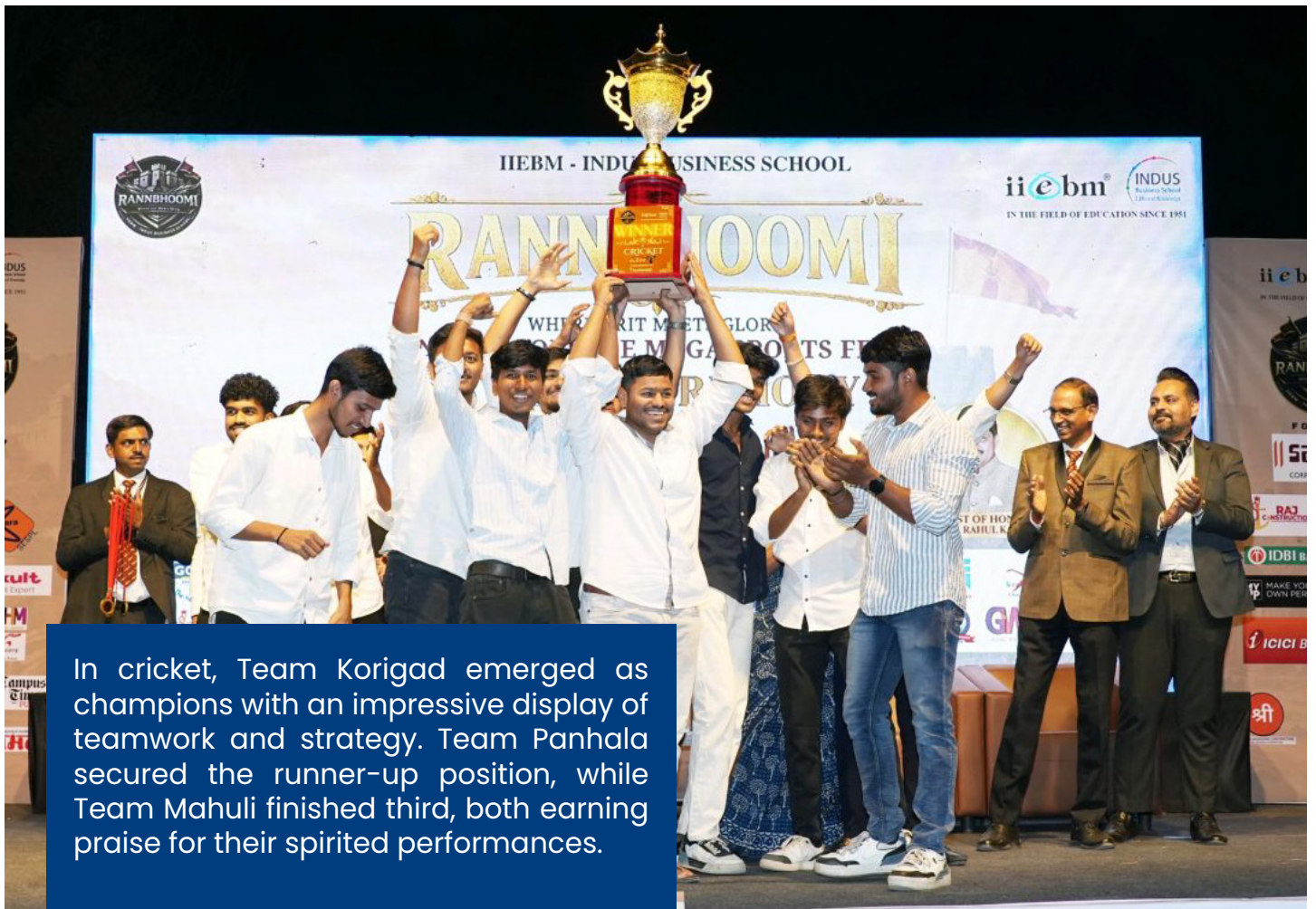
In cricket, Team Korigad emerged as champions with an impressive display of teamwork and strategy. Team Panhala secured the runner-up position, while Team Mahuli finished third, both earning praise for their spirited performances.